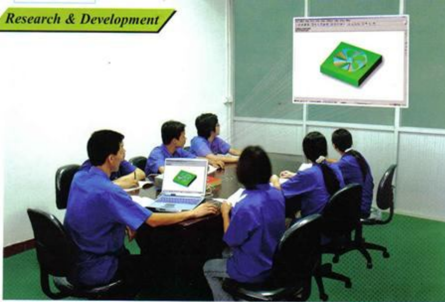
產品開發研討會 Product development meeting