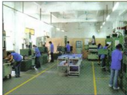
放電加工床 EDM Processing →