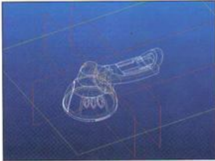
2D圖檔 2D graphic →