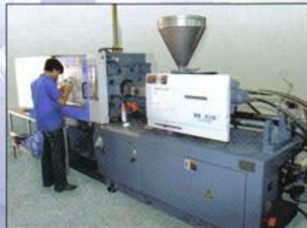
驗模機 Mould testing