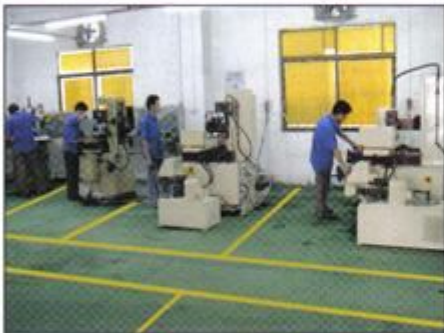
精密磨具加工 Accurate tooling →