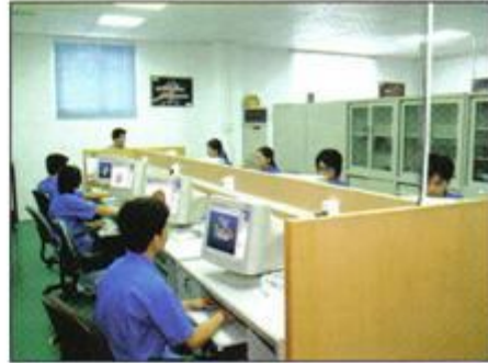
工程部門 Engineering department →