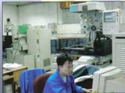
高精密線切割加工機 CNC Wire Cut →