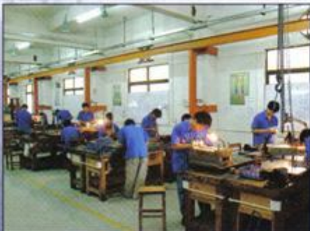
模具裝配車間 Mould assembling workshop →