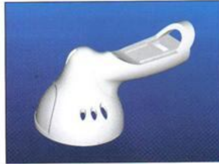
3D圖檔 3D drawing →