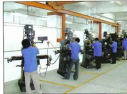
鏜床機加工 Milling →