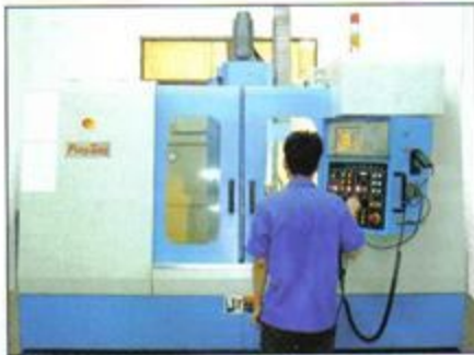
CNC加工床 CNC Processing →